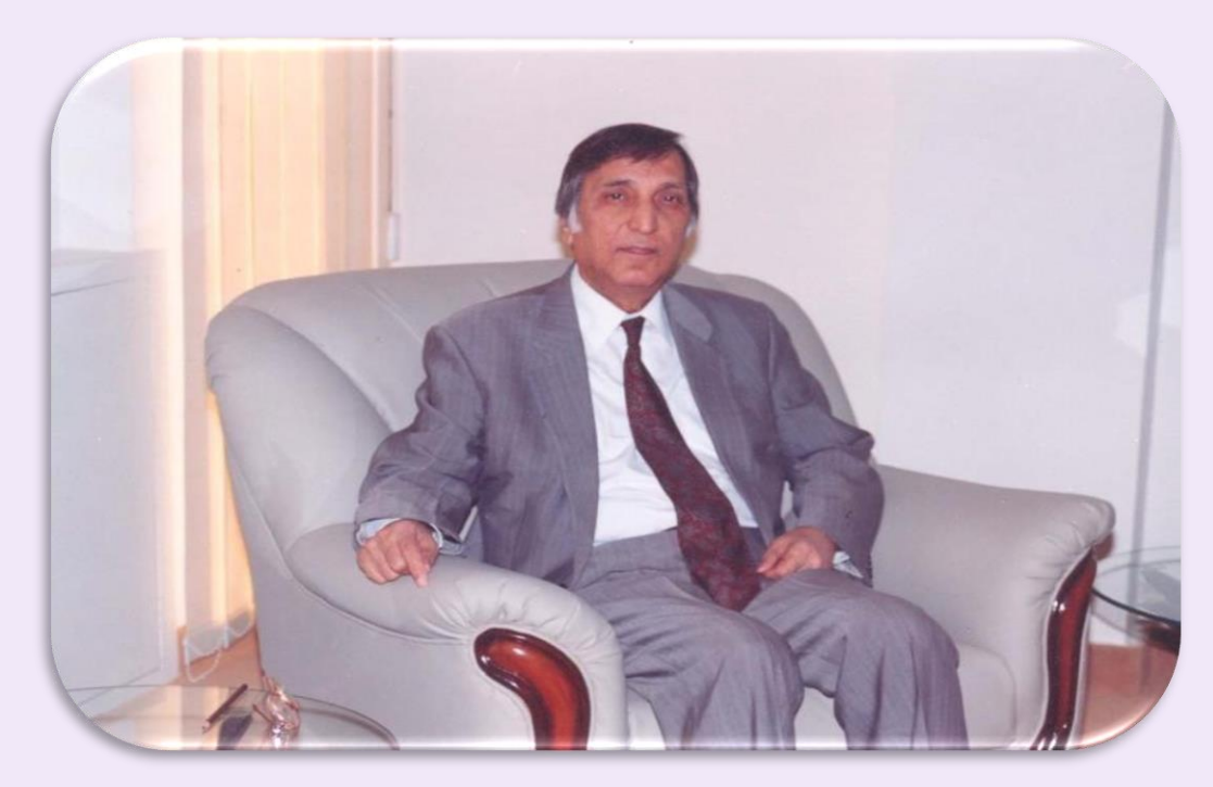
Late Dr. S. M. Qureshi

Pakistan like many other developing countries needs to develop its education system to achieve multiple goals of training people in emerging fields and at different levels, both quantitatively as well as qualitatively to run a contemporary modern society and meet the requirements of the new century concerning the economic development, national security as well as the value system.